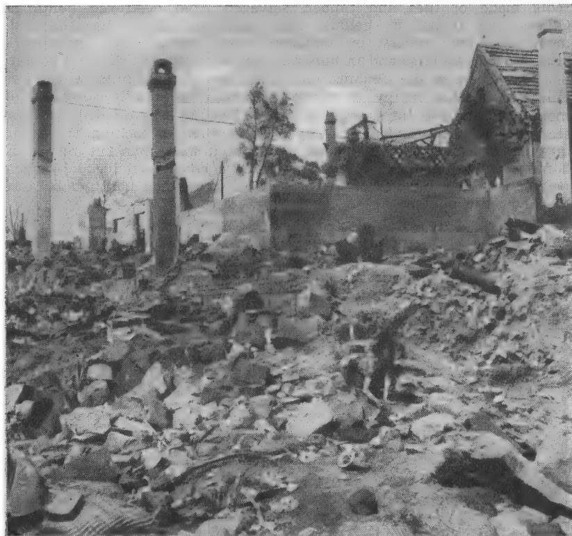
Church at Phŏngyang

bombs, although each of them was marked on the roof with a large red cross in accordance with the provisions of International Convention. Members of the Commissions saw the remains of these crosses on what was left of the roofs. In one hospital 26 patients were burned to death by flames from incendiary bombs.